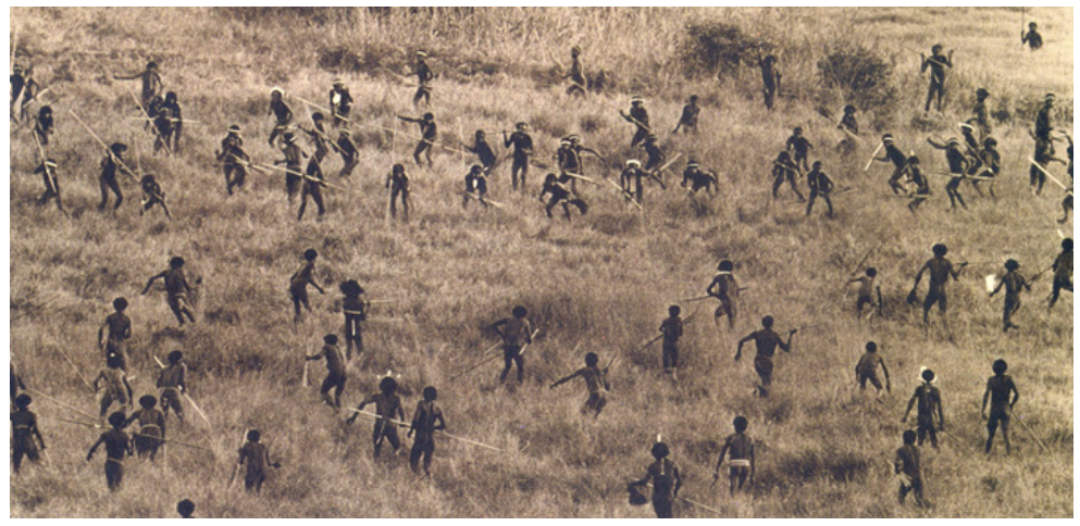
Figure 5. A skirmish between two Dani tribes in the Baliem Valley of the New Guinea Highlands. Their myths are mutually exclusive. Each thinks their group is better. The nationalistic myths of nation states are also mutually exclusive. Whether national myths promote or inhibit the survival of nationalists is an on-going concern of humanity.

In a life short and uncertain, it seems heartless to do anything that might deprive people of the consolation of faith when science cannot remedy their anguish. Those who cannot bear the burden of science are free to ignore its precepts. But we cannot have science in bits and pieces, applying it where we feel safe and ignoring it where we feel threatened – again, because we are not wise enough to do so. (Sagan 1997, p 279-80)