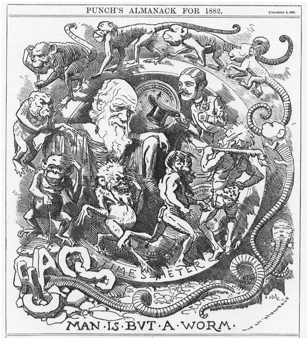
Figure 1. In 1882 (the year Darwin died) <u>Punch Almanack published</u> "MAN IS BUT A WORM", in which Charles Darwin, like the Christian god in the Sistine Chapel, looks on benevolently as a worm emerges from the letters C-H-A-O-S and evolves counter-clockwise into a Victorian Englishman. The word "BUT" suggests that it is bad to be a worm. This illustration was inspired by Darwin's last work: The Formation of Vegetable Mould through the Action of Worms, with Observations on their Habits (1881).

Sociobiology (Wilson 1975) is the systematic study of the biological basis of all social behavior. It can be understood as