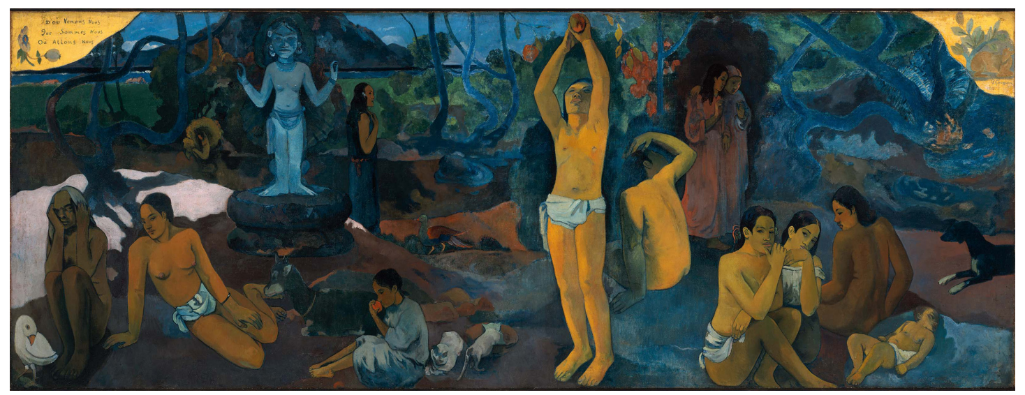
Figure 2. In 1897 (fifteen years after Figure 1) in French Polynesia, post-impressionist Paul Gauguin painted "Where do we come from? What are we? Where are we going?" These fundamental anthropocentric questions are inscribed in French in the upper left of the painting. Gauguin's images suggest that he is not looking for scientific answers to these questions. The beginning of a human life is on the right, the end of a human life is on the left. There is a blue idol of a god, maybe some worshipping going on, but there are no evolving monkeys. In debt and despair, Gauguin painted this while mourning the sudden death of his nineteen-year-old daughter Aline. After finishing this painting, Gauguin unsuccessfully tried to kill himself with arsenic. (Image from <u>wiki Commons</u>, Museum of Fine Arts, Boston)

Perhaps motivated by witnessing the nationalistic delusions that led to the Great War, Bertrand Russell (1919) described the prevalence and usefulness of comforting fictions,